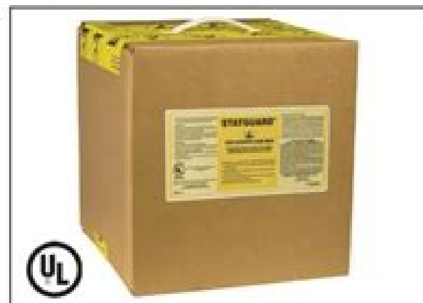
Figure 1. Statguard® Floor Finish